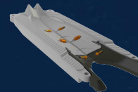
SUNPORT2 PWC Drive-On Dock