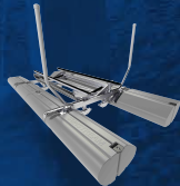
FLOATLIFT Free-floating Hydraulic Boat Lift