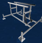
SUNLIFT LEGACY Original Hydraulic Free-standing Lift