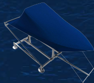
SWIFTSHIELD Automatic Cover System