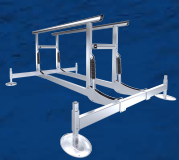
SUNLIFT X Next-Gen Free-Standing Lift